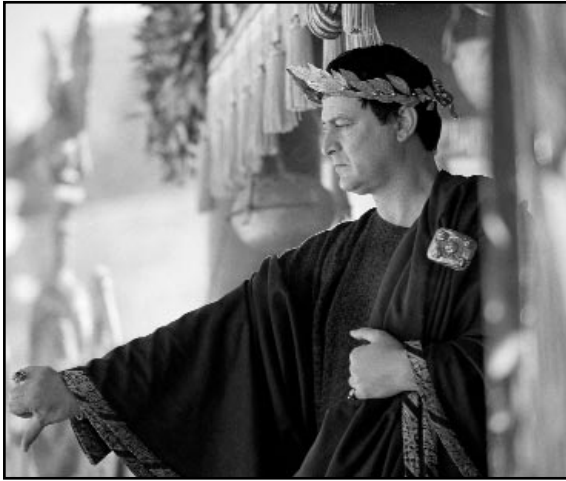
Titus was one of the most popular emperors in Roman history

To hold onto power, he decided to curry favour with the populace, by laying on extremely lavish inaugural games when the Colosseum was completed. His reign was far shorter than his father’s. He died of a mysterious illness only six months after the inaugural games. News of his death was greeted with spontaneous mourning. The games had turned Titus into one of the most popular emperors in Roman history.