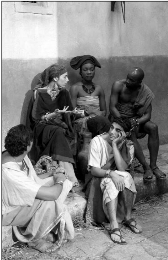
People in Pompeii do not realise it is their last day