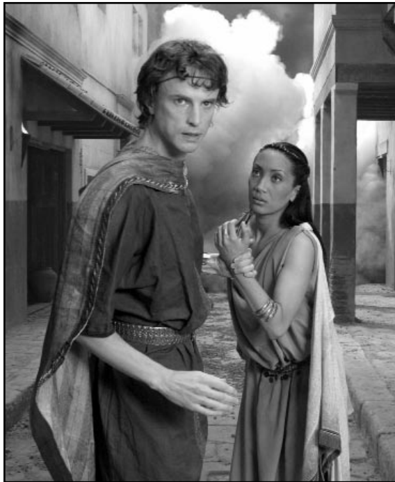
The volcanic surge reaches Pompeii as Stephanus remains defiant

the danger of living in its shadow. With no word in Latin for volcano, they might have thought the eruption was a message from the Gods. Pompeii – The Last Day is their story.